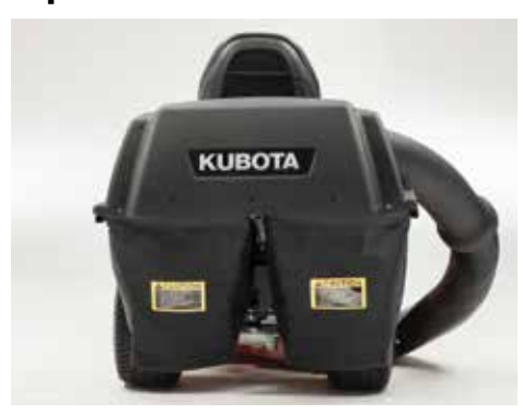
• Grass catcher 2 bag with 7 Bushel capacity