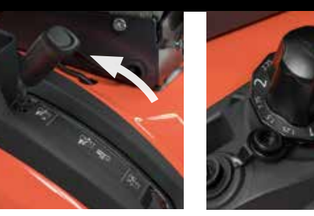
Pull the lever to lift the deck