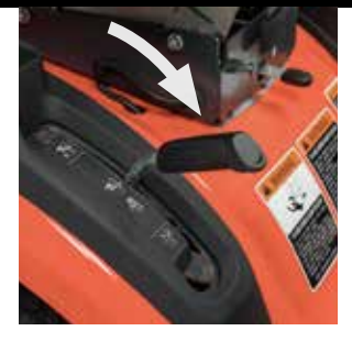
Release the lever to lower the deck