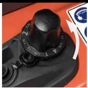
Use the dial to adjust the cutting height