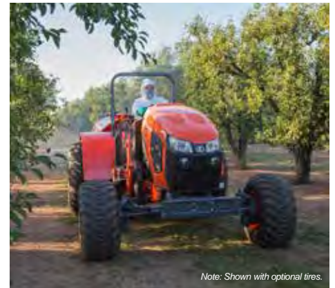
Note: Shown with optional tires.