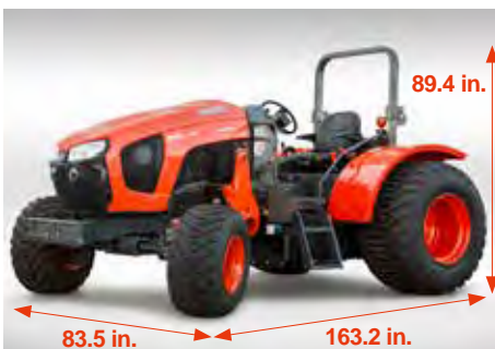
Note: Dimensions taken with standard tires, but shown here with optional tires.