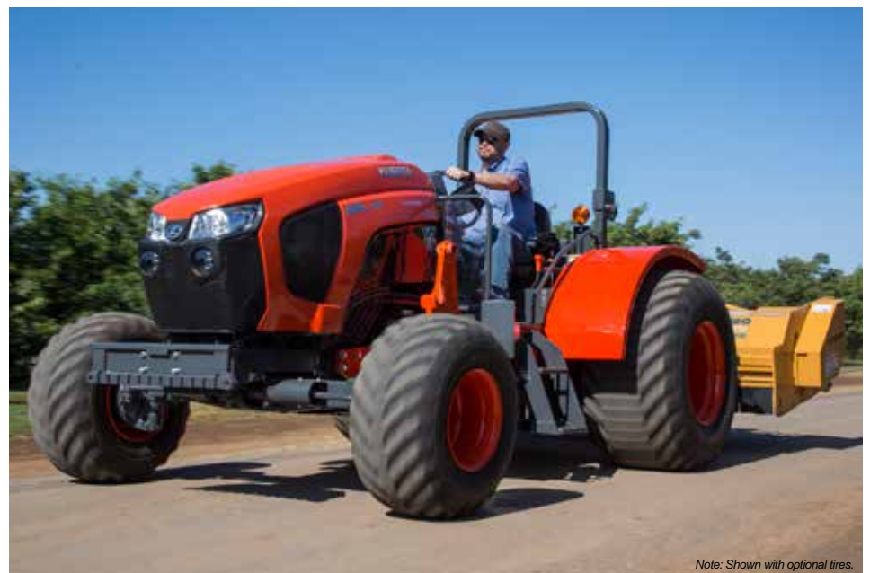
Note: Shown with optional tires.