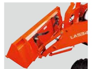
Light Material Bucket 60"