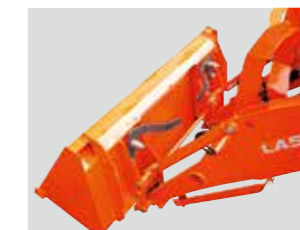
Standard Bucket 54"