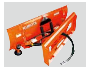
Hydraulic snow Blade 60" & 72"