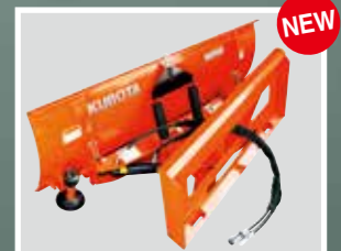
• Hydraulic Snow Blade 60" & 72"