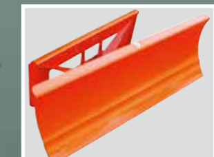
• Mechanical Snow Blade 60" & 72"