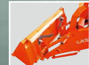
• Standard Bucket 54"