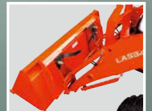
• Light Material Bucket 60"