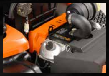
Removable Engine Cover