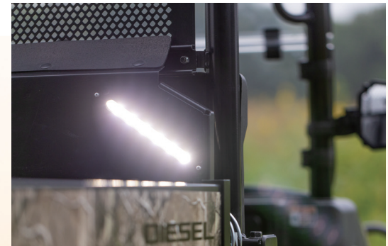
Led Light Cargo Panel