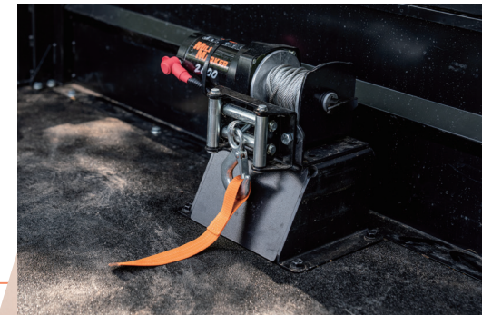
Cargo Bed Winch