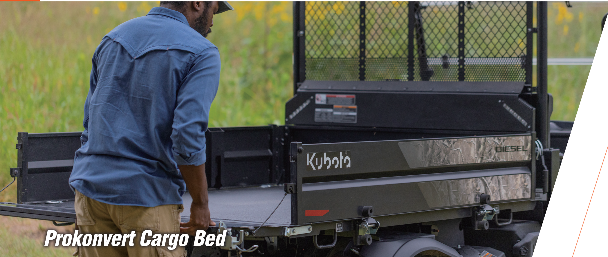
Prokonvert Cargo Bed