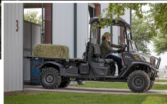
Tool-less Flatbed Conversion