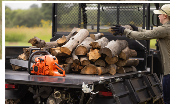
Foldable Side Panel