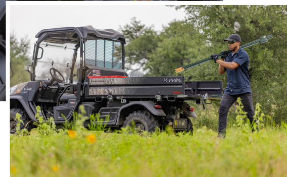
Full Steel Cargo with Spray-on Bed Liner