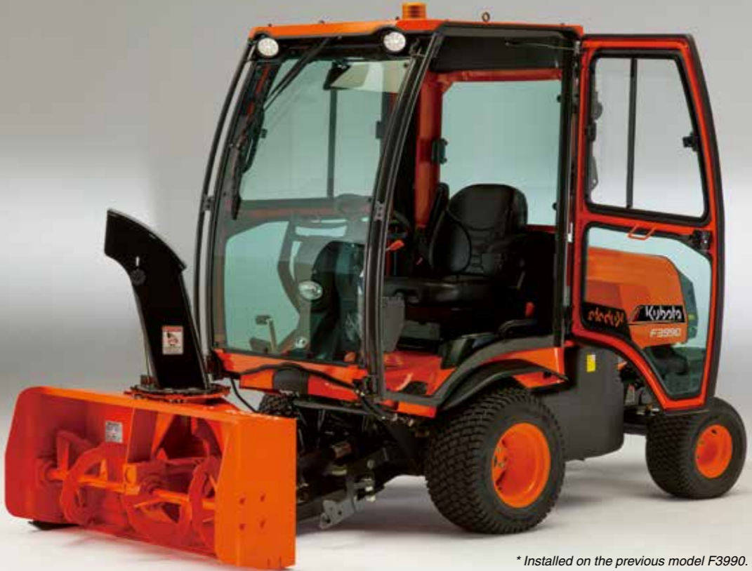
* Installed on the previous model F3990.

Heavy-duty options for specialized applications.