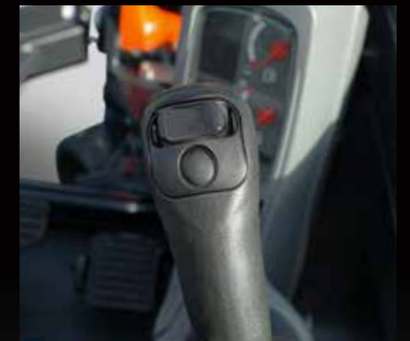
Right control lever

The thumb-operated switch on the right joystick allows easy proportional flow control of the AUX circuit.