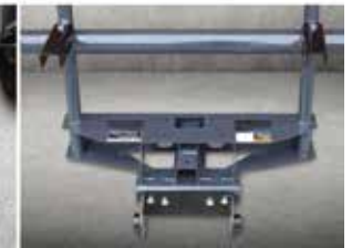
Optional front grill adaptor kit