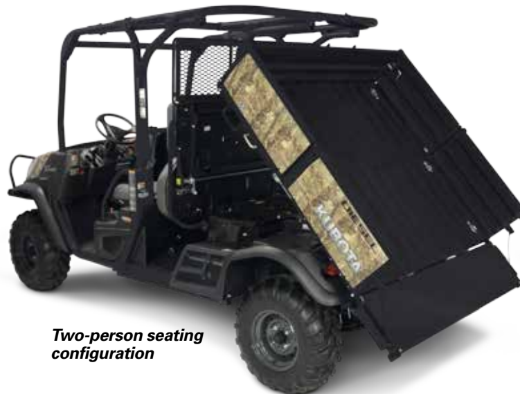
Two-person seating configuration

Dump sand, gravel, turf, or just about anything you can think of, from the RTV-X1140's whopping, 19.1 cu. ft./9.9 cu. ft. (two-seat and four-seat configurations, respectively) capacity cargo bed. An easy-to-operate lever activates this hydraulic bed-lift system in either two or four-seat configuration.