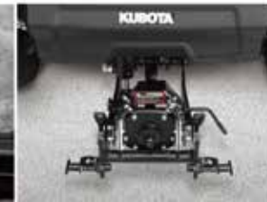
4 point hitch