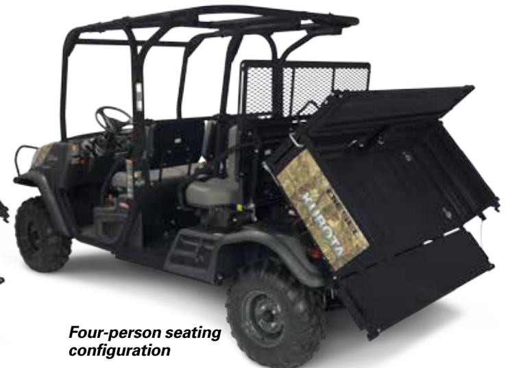
Four-person seating configuration