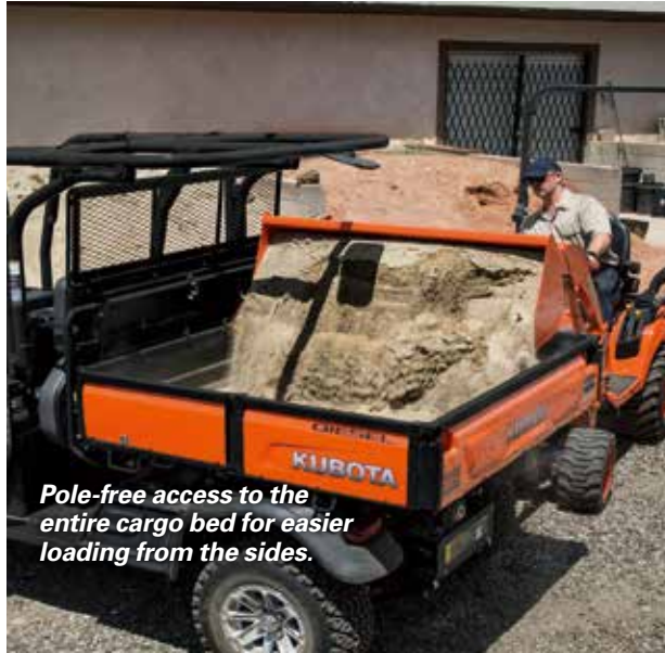
Pole-free access to the entire cargo bed for easier loading from the sides.

The poles at the rear have been eliminated for a cleaner look and easier cargo loading from the sides in the 2-seat configuration. A 5th pole has been added in the rear middle of the frame to ensure the same high level of ROPS performance that meets the SAE J2194 and OSHA 1928 ROPS standards.